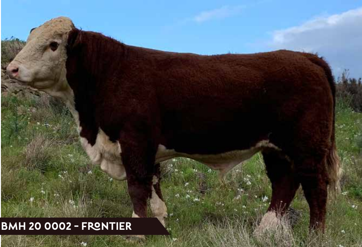
BMH 20 0002 - FRONTIER