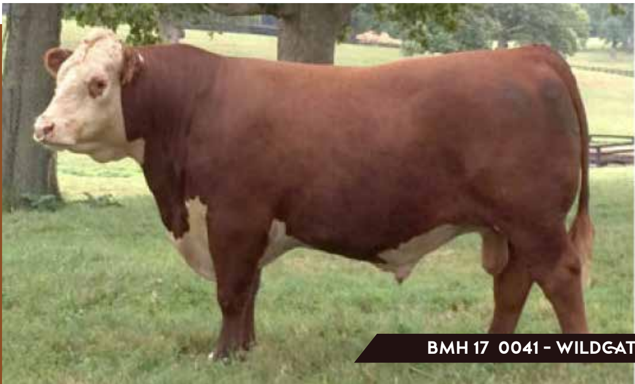
BMH 17 0041 - WILDGAT